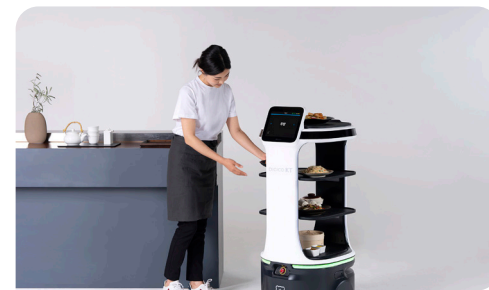
CLIENT Bear Robotics DATE 2022