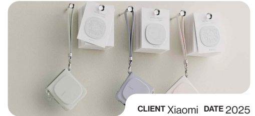
CLIENT Xiaomi DATE 2025