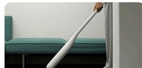
CLIENT VLUDOT DATE 2022