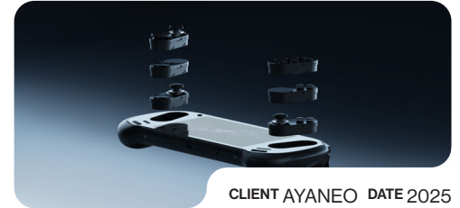
CLIENT AYANEO DATE 2025