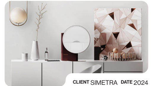
CLIENT SIMETRA DATE 2024