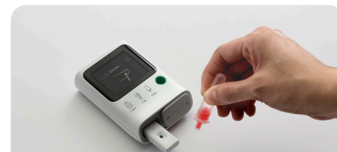
CLIENT Orange Biomed DATE 2023